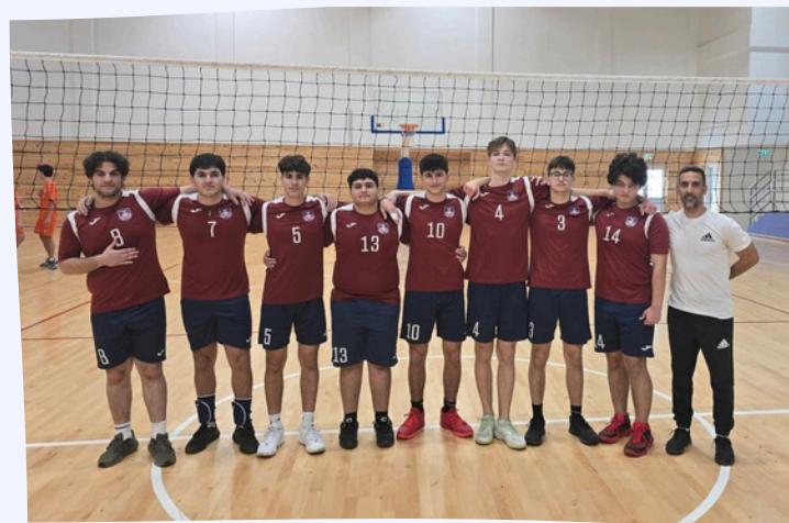
Upper School Boys " Volleyball Team 2nd Place