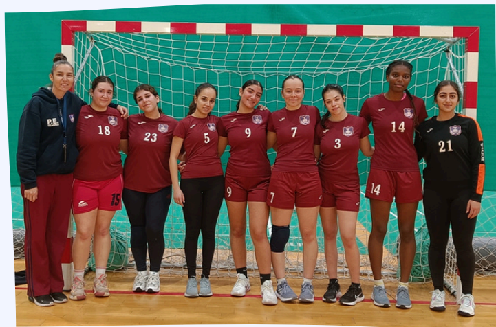
Upper School Girls ' Handball Team 2nd Place