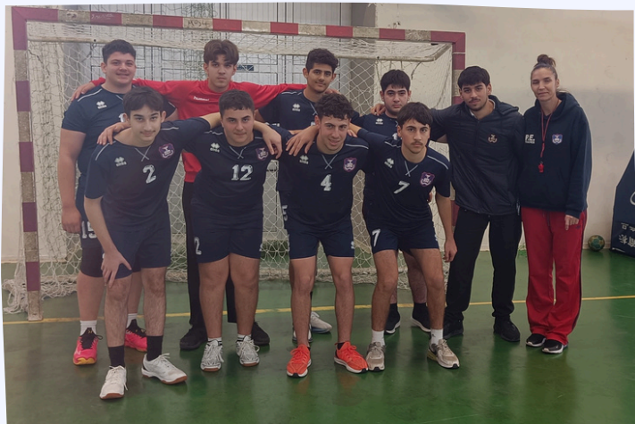
Upper School Boys ' Handball Team 2nd Place